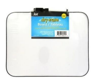
Dry erase board