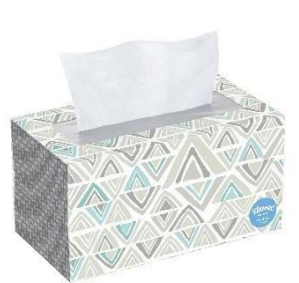
1 tissue box