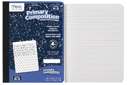
3 Primary Composition Journals (full page)