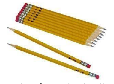
2 packs of standard yellow #2 pencils