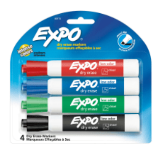
1 pack of dry erase markers