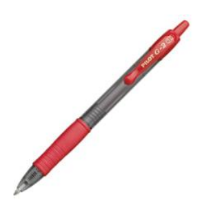
2 red pens