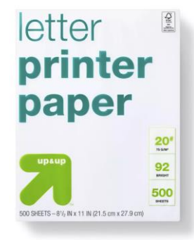
1 Ream of Copy Paper (500 pages, 8.5 x 11 in.)

***NO ROLLING BOOK BAGS ALLOWED FOR SAFETY REASONS***