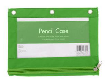
1 large pencil pouch or case