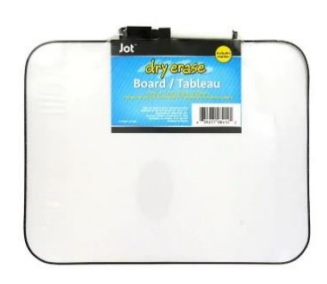
Dry erase board with eraser