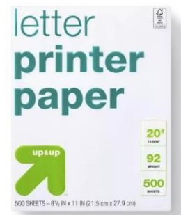
1 Ream of Copy Paper (500 pages, 8.5 x 11 in.)

***NO ROLLING BOOK BAGS ALLOWED FOR SAFETY REASONS***