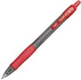
2 red pens