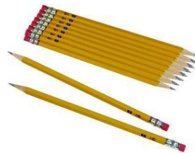
2 packs of standard yellow #2 pencils (non-mechanical)