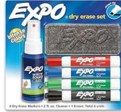
1 pack of dry erase markers