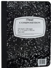
6 wide-ruled composition books (3 black, 1 blue, 1 green, 1 red, no other colors please)