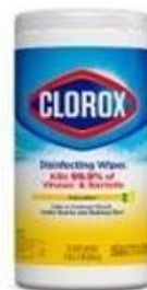
3 packs of Disinfecting Wipes