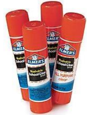
4 glue sticks (jumbo)