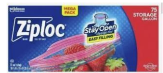
1 pack Gallon Ziploc bags 1 pack of Quart Ziploc bags