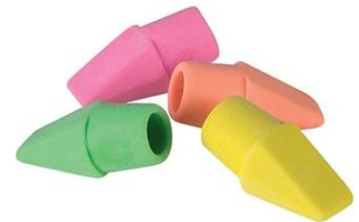
1 pack of Eraser Caps