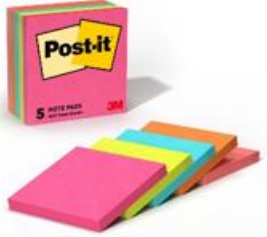
1 pack of Post-it notes