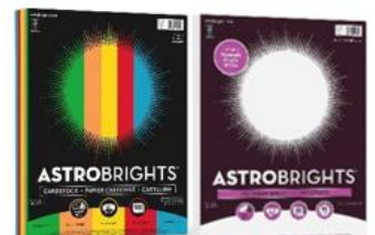
1 pack of White and Colored Cardstock Paper