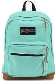
1 bookbag (no wheels)