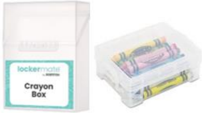
1 clear plastic crayon box