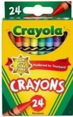
2 packs of regular crayons (24 colors)