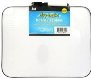
Dry erase board (8.5" x 11")