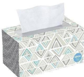
1 Tissue Box