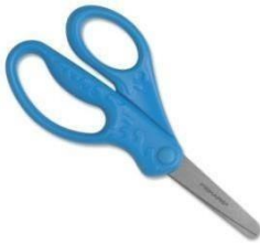
1 pair of children's scissors