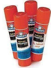
4 glue sticks