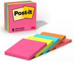
1 pack of Post-it notes