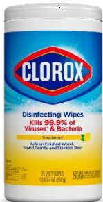
3 packs of Disinfecting Wipes