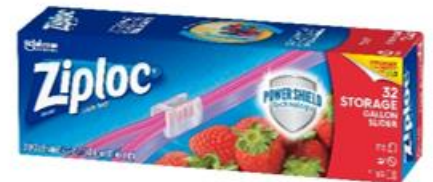
1 pack of Ziploc Gallon bags