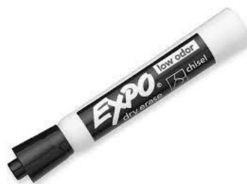
1 Dry Erase Marker