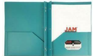
4 plastic duotang folders with prongs (red, blue, yellow, green)