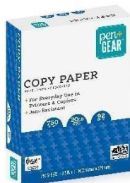
1 pack of Copy Paper