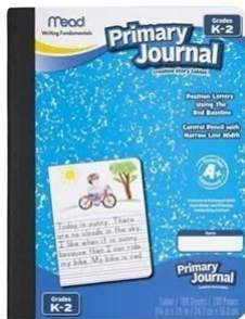
3 primary composition books (half page)