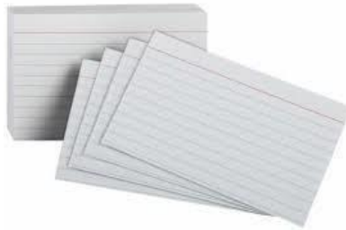
2 packs of Index Cards (3" x 5")