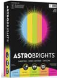
1 pack of 100 sheets Colorful Cardstock Paper