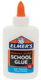
4 glue sticks + 1 bottle of White Glue