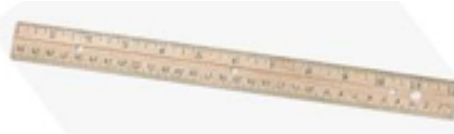
12inch wooden ruler (inches/centimeters)