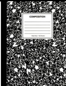
6 Composition Journals