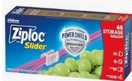
1 box (68 pack) Gallon Size Ziploc Bags