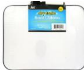
Dry erase board (Required size 9x12)