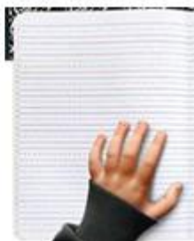
2 Primary Lined Full Page Composition Journal