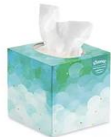
1 box of Tissue