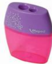
Sharpener (Keep at home)