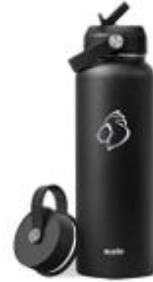
Reusable Water Bottle (non-leaking)