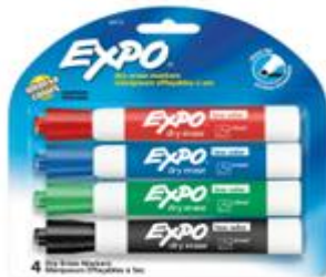
1 pack of dry erase markers