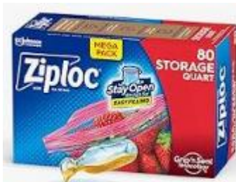
1 box (80 pack) Quart Size Ziploc bags