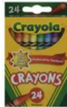
24 pack Regular Crayons