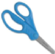
1 pair of children's scissors