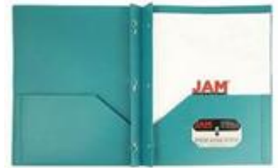
5 plastic duotang folders with prongs and pockets (3 Green & 2 Blue)