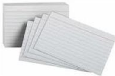
3 packs of index cards (3x5)