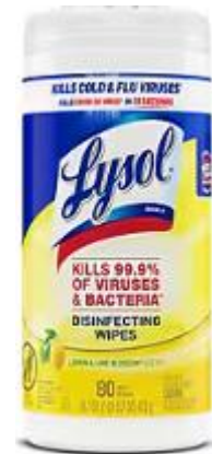
80 sheets of Lysol Wipes