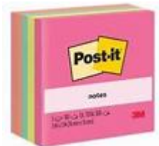
Post-It Notes (3x3)