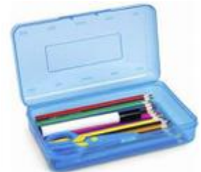
1 Pencil box