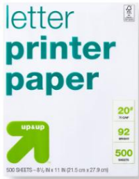
1 pack of 500-750 sheets Copy Paper