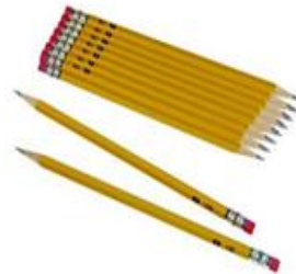
2 packs of Standard Yellow #2 Pencils