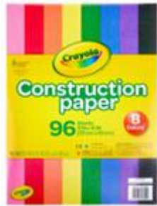
1 pack of 100 sheets of Construction Paper