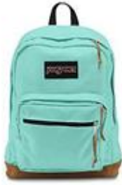
1 bookbag (no wheels)