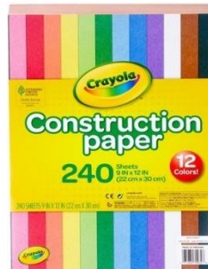
1 pack of Construction paper