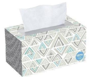
1 tissue box