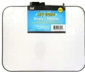
Dry erase board