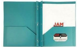
4 plastic duotang folders with prongs (red, blue, yellow, green)