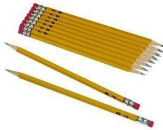
2 packs of standard yellow #2 pencils