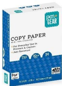
1 pack of copy paper