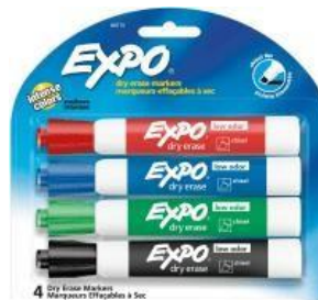
1 Pack of Dry Erase Markers