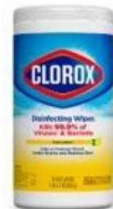
2 packs of Disinfecting Wipes

***NO ROLLING BOOK BAGS ALLOWED FOR SAFETY REASONS***