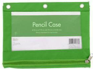
1 large pencil pouch with zipper