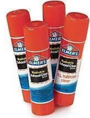
4 glue sticks