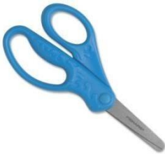
1 pair of children's scissors