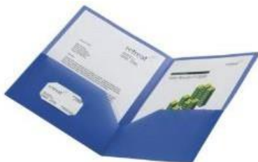
1 plastic folder with pockets for HW (any color)