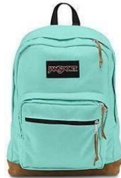
1 bookbag (no wheels)