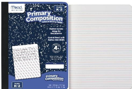
3 Primary Composition Journals (full page)